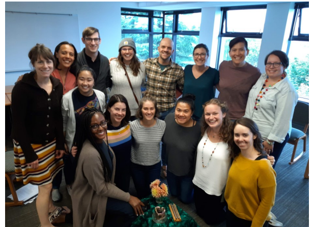
CLA-Seattle Cohort #6 gathered at a Professional Development training in January 2020